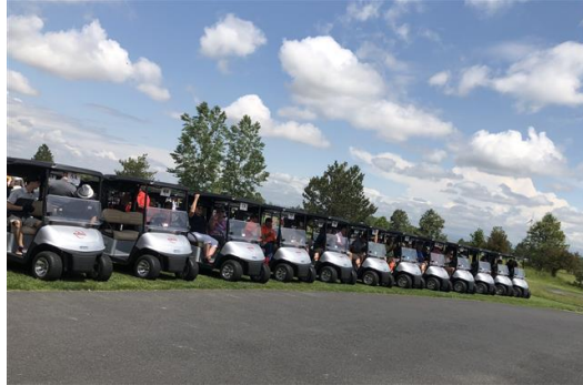
Getting ready to head out and tee off!