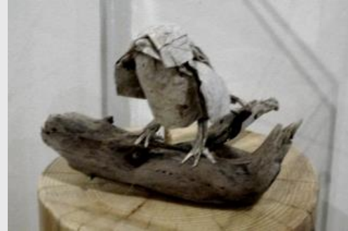
Little Bird 2016 by Grayson Hughb

Young artists are competing for Grand Prizes, Awards of Excellence, Awards of Merit, Honorable Mentions, and Best Emerging Artist. The Artists' Choice award is determined by the participants themselves.